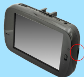
Touch screen models